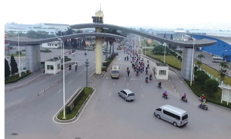
Thang Long Industrial Park